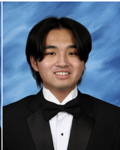
Swanted Win Rutgers University